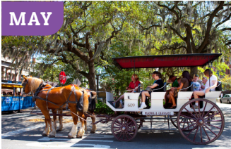
Savannah, GA May 1-4, 2023