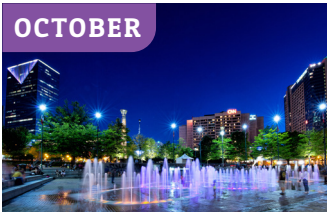
Atlanta, GA October 24-27, 2023