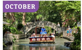
San Antonio, TX October 3-6, 2023