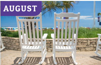
Virginia Beach, VA August 8-11, 2023