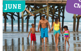
Myrtle Beach, SC June 26-29, 2023