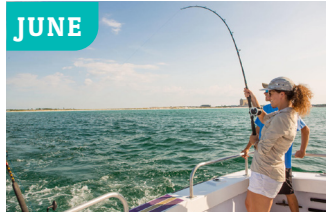
Destin, FL June 13-16, 2023