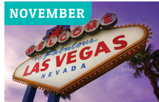
Las Vegas, NV November 14-17, 2023

To learn more information and additional event details, visit: