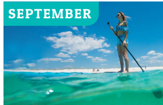
Pensacola Beach, FL September 12-15, 2023