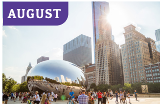
Chicago, IL August 29-September 1, 2023