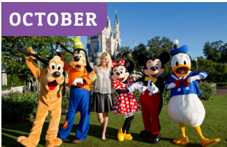
Orlando, FL October 16-19, 2023