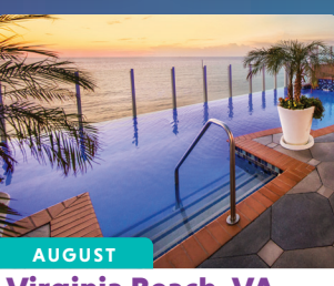
Virginia Beach, VA August 6-9, 2024