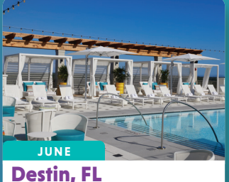
Destin, FL June 11-14, 2024