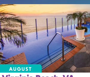
Virginia Beach, VA August 6-9, 2024