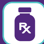
Pain Management & Pharmacology