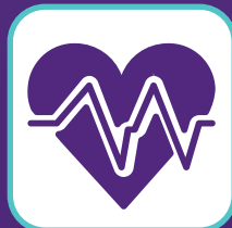
Cardiology & Emergency Medicine