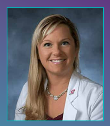
4:00 - 6:30 pm

Conquering Cardiology: Mastering the EKG