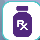
Pain Management & Pharmacology