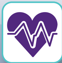
Cardiology & Emergency Medicine